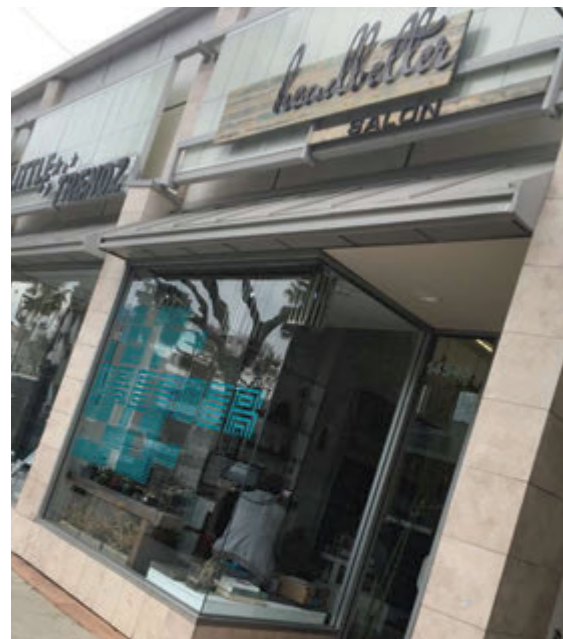
headbetter Salon. LA Discover 419