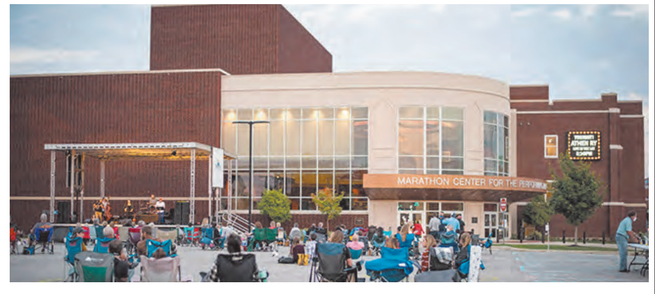
Patrons watch a "pod" concert in the parking lot at Marathon Center for the Performing Arts in October 2020

She explained that while MCPA has not hosted an indoor event since March A series of outdoor concerts will 2020, she is looking forward to bringing take place in MCPA's vast parking the public back together through the