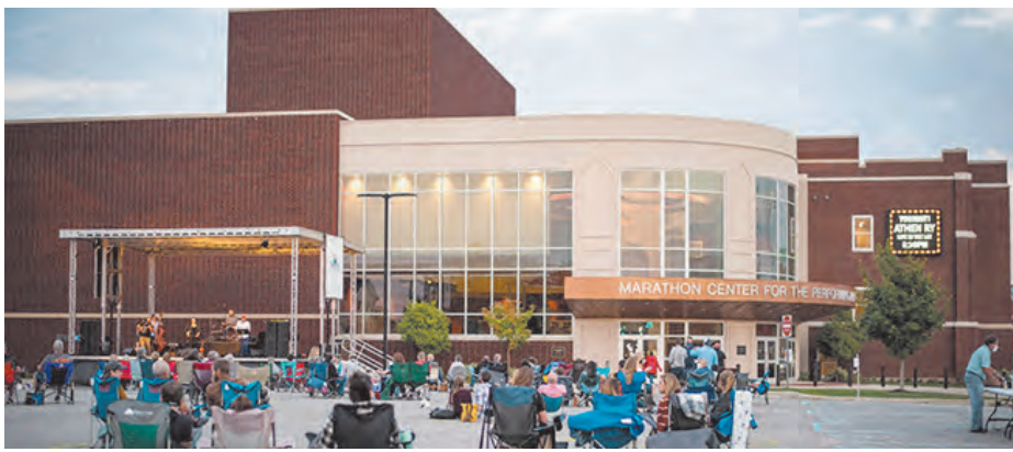
Patrons watch a "pod" concert in the parking lot at Marathon Center for the Performing Arts in October 2020

She explained that while MCPA has not hosted an indoor event since March 2020, she is looking forward to bringing the public back together through the