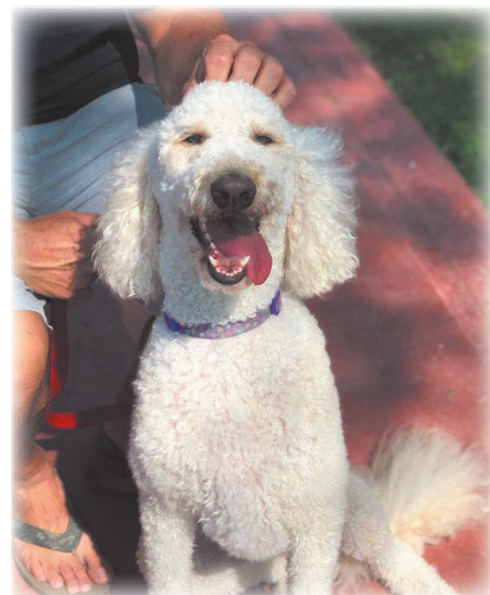
A pooch soaks up the sun at Defiance Bark & Run.

According to the Ohio Department of Natural Resources, it's recommended to keep an updated