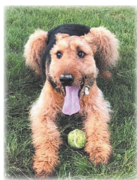
A tired pup rests with a tennis ball at Defiance Bark & Run.

Continued from page 1 owners to play with their pups.