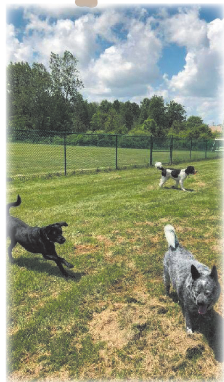
Unleashed dogs play together at Defiance Bark & Run.

To access this park, dog owners must complete a member registry at the Wood County Dog Shelter. Membership is available to those