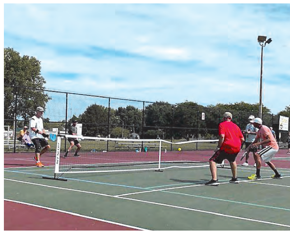
FAR LEFT: A group of players during the 2023 summer season training session at Riverside Park in Findlay.