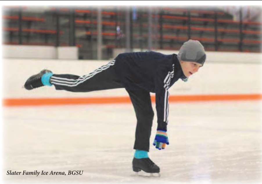
Slater Family Ice Arena, BGSU

open from 7-8 p.m. Fridays and Saturdays.