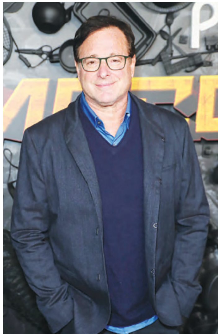
Bob Saget attends the red carpet premiere and party for Peacock’s new comedy series “MacGruber” at California Science Center on Dec. 8, 2021, in Los Angeles.

(Mayer and comedian Jeff Ross paid emotional tribute to Saget after his passing when they picked up Saget’s car at LAX and documented it on