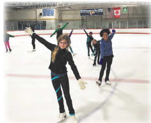
The Cube, Findlay