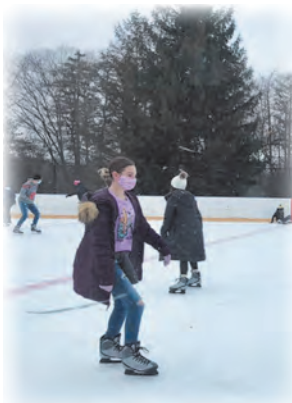
Ottawa Park, Toledo