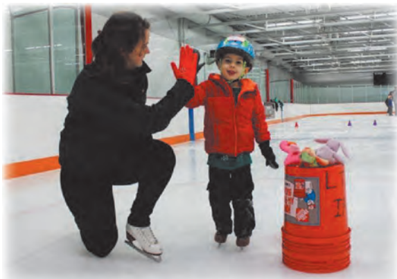
Slater Family Ice Arena, BGSU

Figure skating programs are offered from basic-level courses to senior and gold levels of U.S. figure skating testing. Cheap skate is held from 12:15-1:15 p.m. weekdays, and public skate is