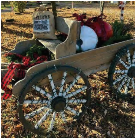
Ghost Town, a replica of an 1880s western town located south of Findlay will once again be transformed into an old-fashioned winter village for the holidays.

Attraction open for the Christmas season By: Jeannie Wiley Wolf Photos provided