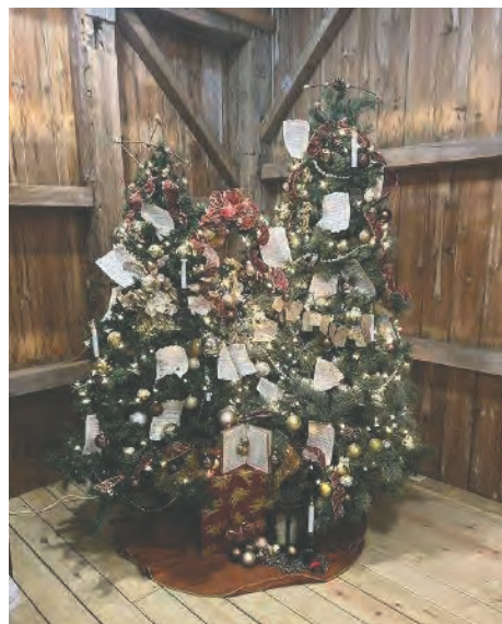
Many trees will fill Ghost Town for the holidays. These three trees have been decorated with sheet music and hymn books.

Ghost Town is located at 10630 County Road 40, 2½ miles south of Findlay.