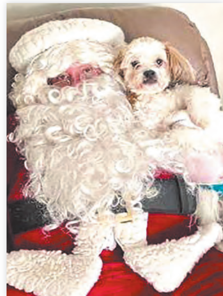
Santa even hears the Christmas wishes of local pets.

Reflecting on Christmases past and those to come, he said, the best gift is always "who is around the tree."