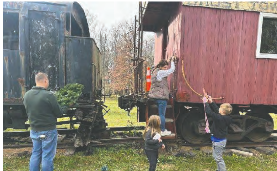
Volunteers provided help to decorate the buildings and other structures, including old railroad cars.