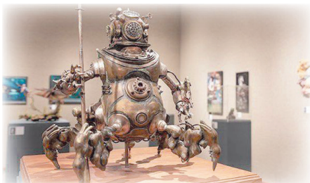
This mixed media sculpture of a Grindylow, a creature from English and Celtic mythology, was one of 24 pieces on display in the University of Findlay Mazza Museum's Enchanted Brush exhibit last year. The exhibition is an annual summer show that features works by artists from around the world.

Mazza Museum offers a variety of displays and activities for children. Below are just a few examples.