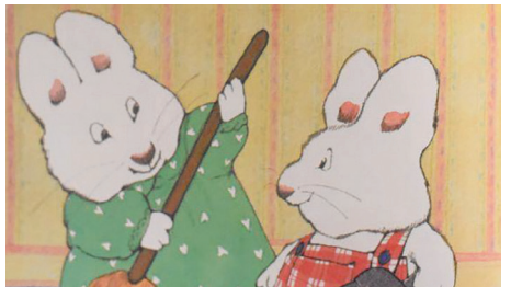
Rosemary Well's original "Max and Ruby" illustration and the final book illustration in "Max Cleans Up" are seen here at the Mazza Museum on the campus of the University of Findlay.

"The Community Foundation, they were very supportive and we're grateful for their generous donation. Really truly the real expense was just the books and a lot of time that different individuals have given to make this happen," he said.