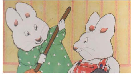
Rosemary Well's original “Max and Ruby” illustration and the final book illustration in “Max Cleans Up” are seen here at the Mazza Museum on the campus of the University of Findlay.

“The Community Foundation, they were very supportive and we’re grateful for their generous donation. Really truly the real expense was just the books and a lot of time that different individuals have given to make this happen,” he said.