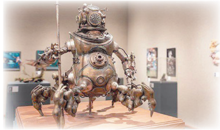
This mixed media sculpture of a Grindylow, a creature from English and Celtic mythology, was one of 24 pieces on display in the University of Findlay Mazza Museum's Enchanted Brush exhibit last year. The exhibition is an annual summer show that features works by artists from around the world.

Mazza Museum offers a variety of displays and activities for children. Below are just a few examples.