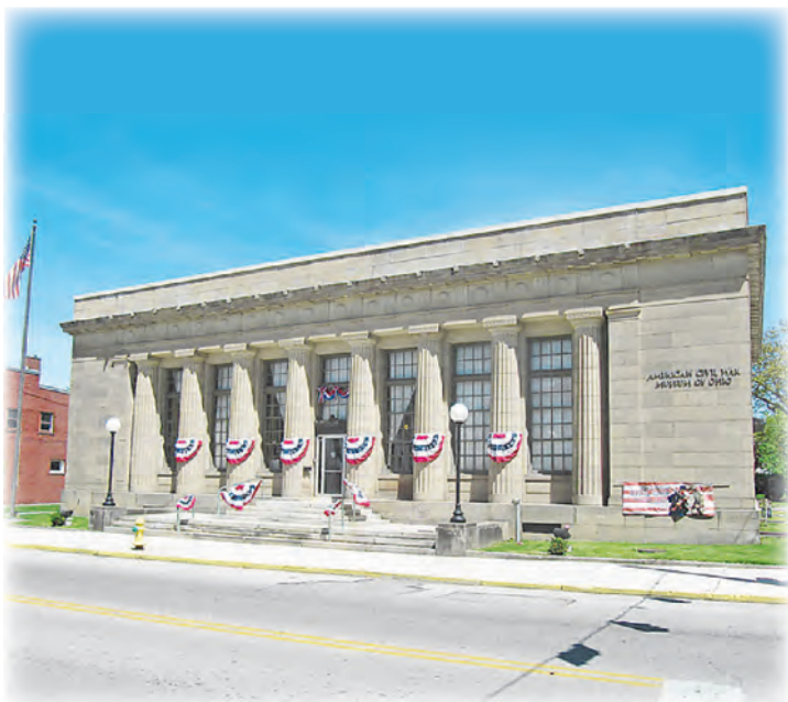
The American Civil War Museum of Ohio in downtown Tiffin

For more information about tours, volunteering or making a donation, call 419-455-9551 or email info@acwmo.org .