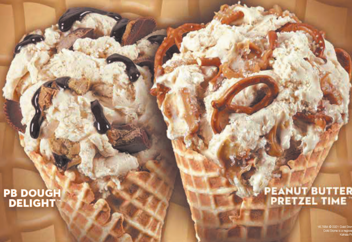
PB DOUGH DELIGHT™