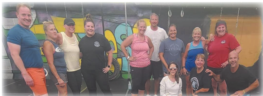
A class poses for a photo at Jim’s Gym.

To learn more about Jim’s Gym, search for it on Facebook or call Steffen at 419-306-8425.