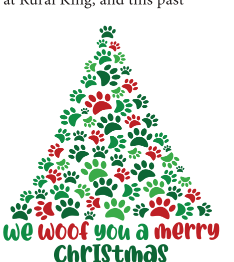
Santa even hears the Christmas wishes of local pets.

Reflecting on Christmases past and those to come, he said, the best gift is always "who is around the tree."