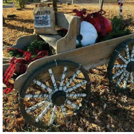
Ghost Town, a replica of an 1880s western town located south of Findlay will once again be transformed into an old-fashioned winter village for the holidays.

Attraction open for the Christmas season By: Jeannie Wiley Wolf