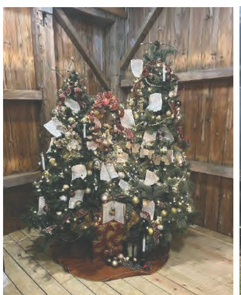
Many trees will fill Ghost Town for the holidays. These three trees have been decorated with sheet music and hymn books.

Ghost Town is located at 10630 County Road 40, 2½ miles south of Findlay.