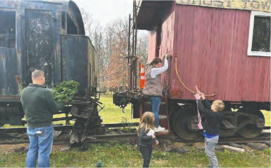
Volunteers provided help to decorate the buildings and other structures, including old railroad cars.